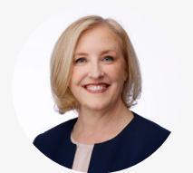
Hon. Lisa Raitt, P.C. Vice-Chair, Global Investment Banking, CIBC and PPF Board Member