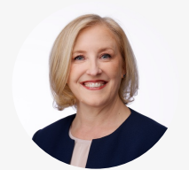
Hon. Lisa Raitt, P.C. Vice-Chair, Global Investment Banking, CIBC and PPF Board Member