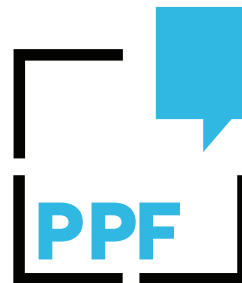
SECONDARY BRAND LOGOS (ACRONYM ONLY)