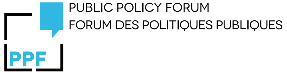
BI LINGUAL PREFERRED BRAND LOGO