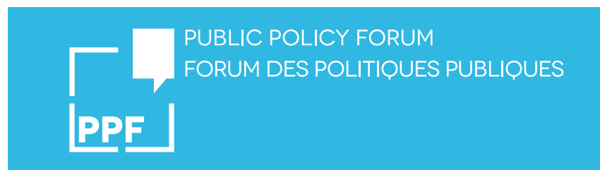
KNOCKED OUT FROM COLOUR BACKGROUND