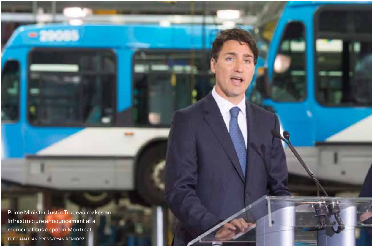
Prime Minister Justin Trudeau makes an infrastructure announcement at a municipal bus depot in Montreal.